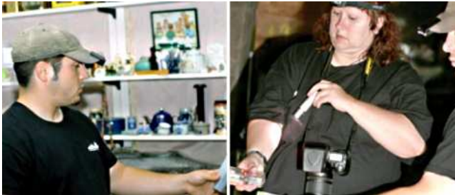
Members of the Motor City Ghost Hunters check for signs of paranormal activity inside the antiques mall

The Motor City Ghost Hunters are a diverse group of 23 individuals formed in 2007, who investigate paranormal activity throughout Michigan. The group's past investigations include a July 11 session at Battle Alley Arcade Antiques Mall in Holly.