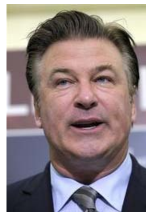
FILE - In this April 6, 2011 photo, actor Alec Baldwin speaks during a news conference on Capitol Hill in Washington, to discuss the Fair Elections Now Act. Baldwin will host "Saturday Night Live," during the premiere of the show's 37th season on Sept 24, 2011.